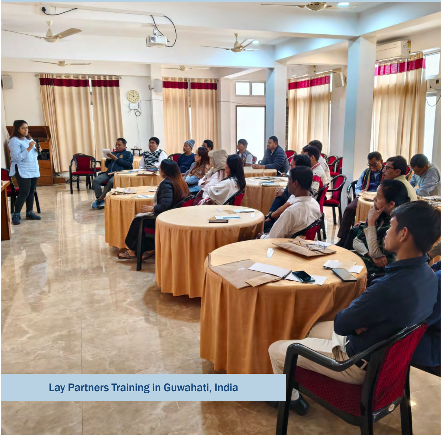
Lay Partners Training in Guwahati, India