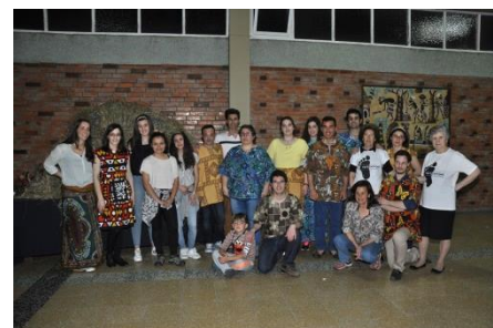
Members of Diálogos lay group