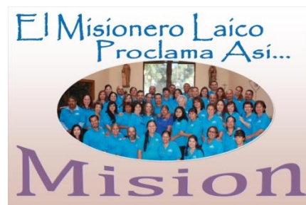
"A Lay Missionary Proclaims in Mission"- MLVD members in California (USW)