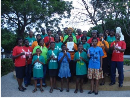
Friends of the SVD- Ghana "share their light" after an April 2016 Vocation Sunday Mass.

The Friends of the SVD (FOS) at St Margaret Mary Parish Dansoman Accra-Ghana was inaugurated at the August 2009 Ordination of SVD priests, which took place in the parish. The initiative to form the group was taken by the Assistant Parish Priest with the support of the Parish Priest. Members of the parish were encouraged to join this group. Total membership now is 34.