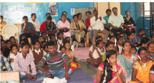
Interaction with tribal children and Self Help Group members

Animated by the Divine Word, we live a Spirit-filled life as individuals and as a group, so that we become empowered missionaries of Jesus Christ. We accomplish this through Arnoldus Spirituality and Missionary Activity in our daily lives, reaching out to the poor and the needy; and personal and interpersonal growth.