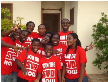
"Join SVD now" Young Members after a performance at Vocation Sunday Mass.

"May the darkness of sin and night of unbelief vanish before the light of the Word and the spirit of grace, and may the heart of Jesus live in the hearts of all. Amen"