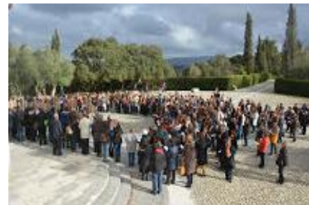
SVD Friends Pilgrimage to Fatima

Submission deadline for next edition: Friday, October 21, 2016