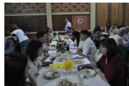
Fund Raising African Dinner

TO SUBMIT INFORMATION AND PICTURES FOR FUTURE PUBLICATION PLEASE SEND TO EITHER ONE OF THE EDITORS: