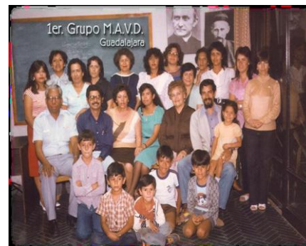
The 1982 "Misioneros Auxiliares" Founding group in Guadalajara, Jalisco, Mexico.