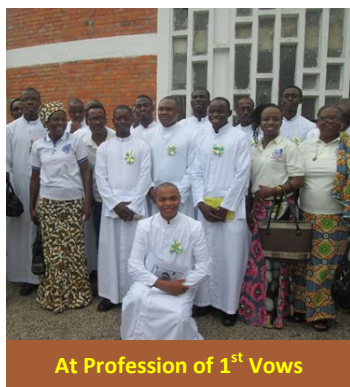
At Profession of 1 st Vows