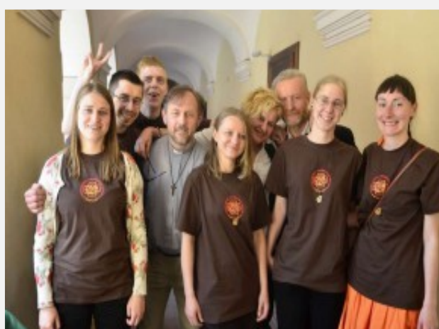
Volunteers in Poland

We are praying that more people will be interested in supporting our activities especially in our visits to rural and poor areas served by the SVDs.