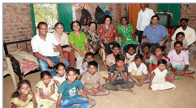
Tala Mission—India Mumbai Province (INM)