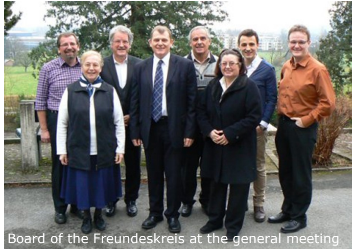
Board of the Freundeskreis at the general meeting

In 2012 the boarding school Marienburg had to be closed. Therefore the Friends of Marienburg – then about 1300 members – changed their general objective: We support the SVD missionary work.