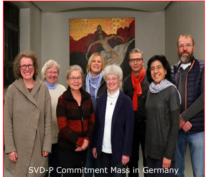
SVD-P Commitment Mass in Germany

We are people like you and me. Our biographies and way of life are very different but we have one in common: the spirituality of the Divine Word Missionaries strengthens our faith and determine our behavior. They describe their purpose as: Bringing the Gospel to everybody, being a fellow for the discriminated, working for peace and protecting the environment are our targets. CONGRATULATIONS!