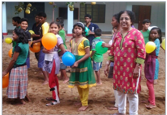
Mission Exposure - India Eastern Province (INE)

Members regularly visit SVD missions where they contribute their time, talents and resources for the common good of community and mission. Recently, 3 teams (5-7 members) visited India Eastern Province (INE), India Central Province (INC) and India Mumbai Province (INM).