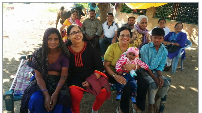
Mission Exposure—India Central Province (INC)