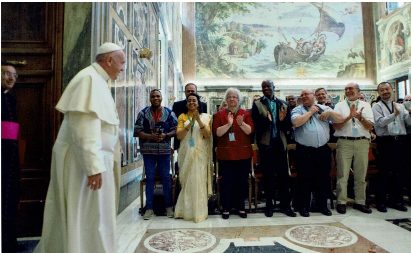
Papal Audience, June 22, 2018