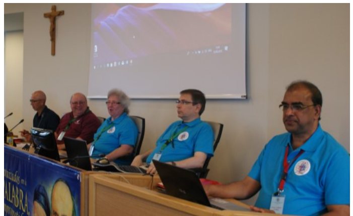
Presentation and Sharing from the Lay Partners