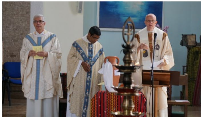
Chapter Closing, July 14, 2018