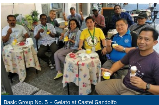
Basic Group No. 5 – Gelato at Castel Gandolfo

The difference this time was that the lay partners attended the entire four weeks of the general chapter, even if two of them had to leave a few days before the official closing of the chapter. This time, four lay partners came from the four zones, two women from ASPAC (India) and EUROPA (Germany) and two men from PANAM (USA) and AFRAM (Kenya). They fully participated, like all other chapter observers, in all the sessions and activities of the chapter – the daily Bible or Life Sharing in basic groups, the discussions and deliberations in the basic groups and in the plenum, the papal audience and pilgrimages, the socials and cultural nights.