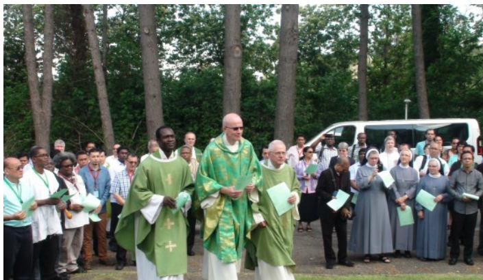
Chapter Opening, June 17, 2018