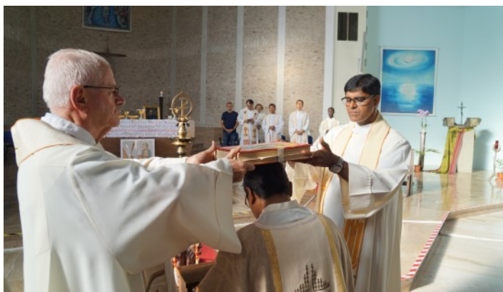
Liturgical celebration—Election of Superior General, July 18, 2018