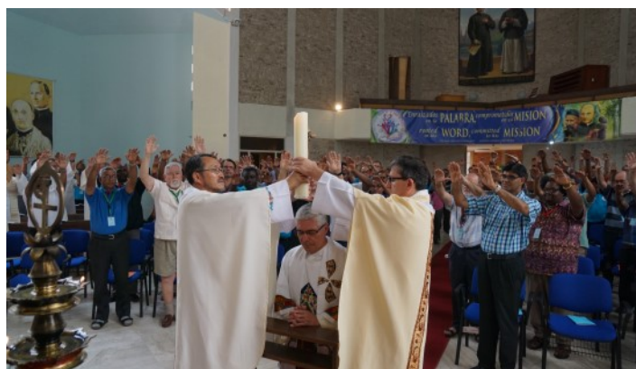
Liturgical celebration—Election of Vice Superior General, July 20, 2018