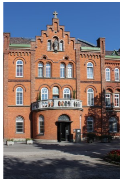
Casa de la Misión San Gabriel en Mödlingen