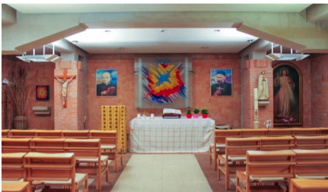
Chapel in the guest house in Budapest