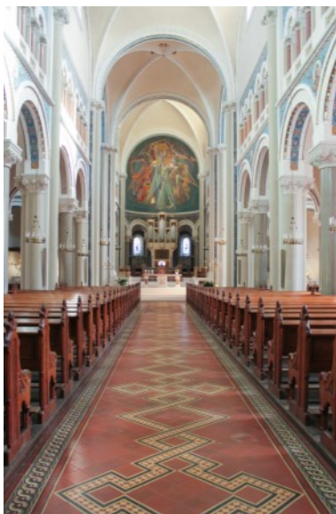
Church of the Missionhouse St. Gabriel