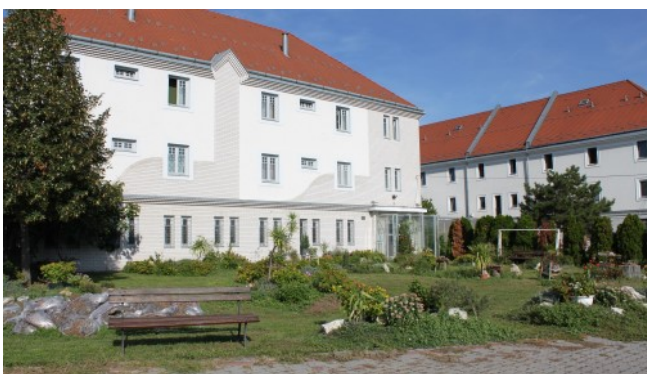
Missionhouse Názáret and training centre in Budapest