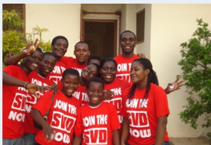
The group of St. Margaret Mary's Parish