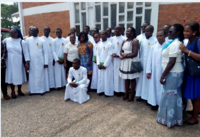
Profession of First Vows