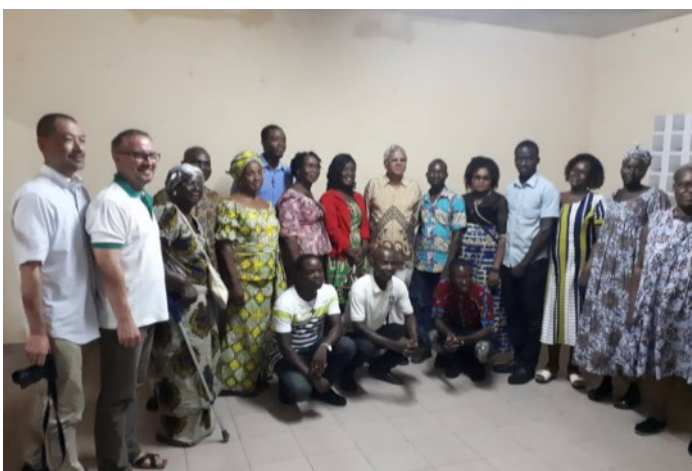
Friends of SVD, Togo