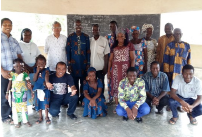
Friends of SVD, Benin

My visit to Ghana and Togo was a learning experience, it was a good opportunity to meet the missionaries and SVD lay partners. Although, this was a hectic trip visiting various parishes, institutions and people, meeting the SVD lay partners in some places enthralled me seeing their interest and their commitment to the mission. Here, I share my experience of meeting the lay partners in these countries.