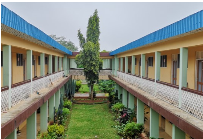
Divine Word Novitiate