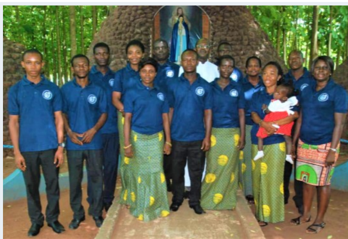
The group of St. Augustine's Parish, Asesewa