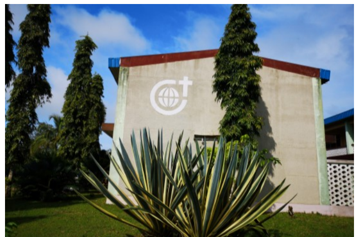
Divine Word Novitiate