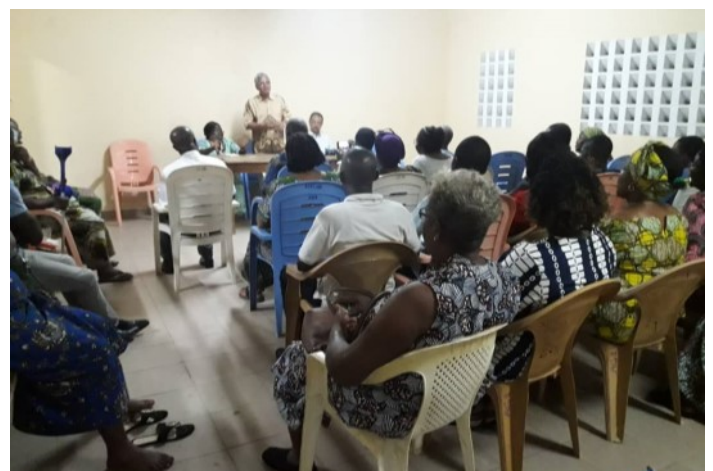
Friends of SVD, Togo