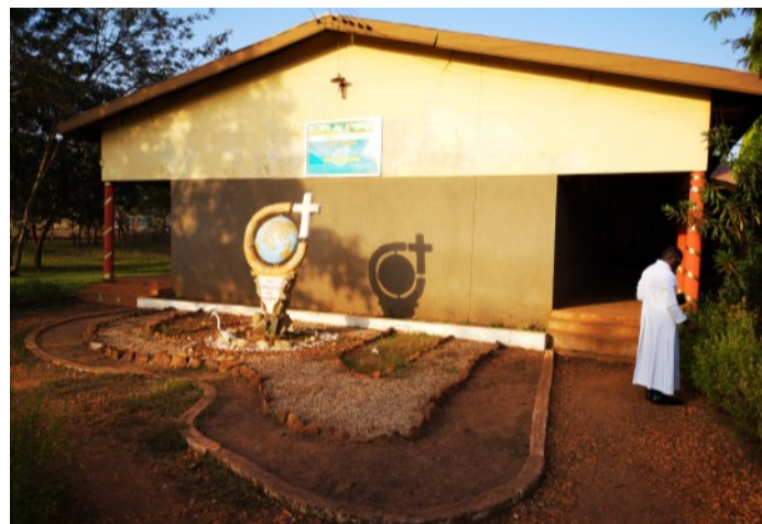
Chapel of the St. Joseph Freinademetz House of Philosophy

St. Joseph Freinademetz House of Philosophy in Tamale was founded in 1984 and the SVD Mission House the novitiate in Nkwatia-Kwahu in 1957.