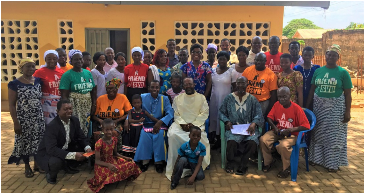
Friends of SVD, St. Joseph's Parish, Kintampo