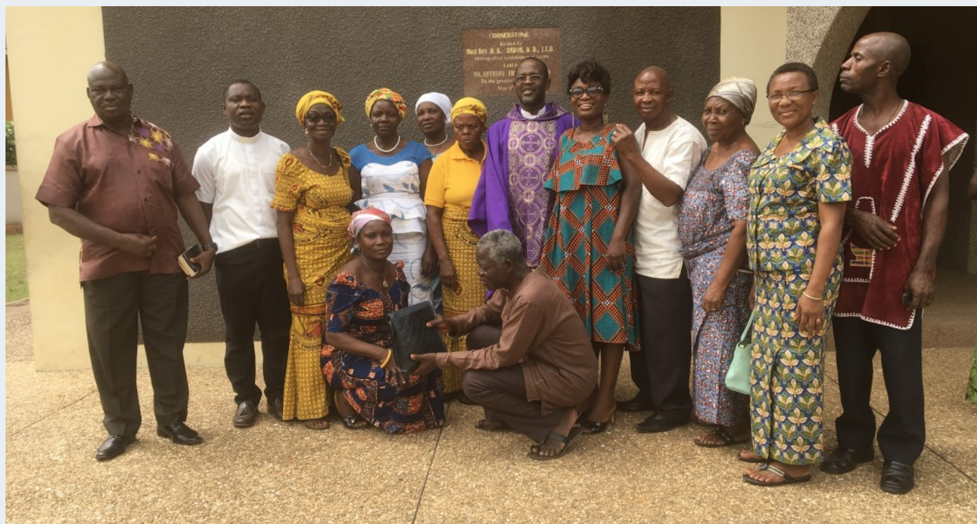
The group of St. Luke's Parish