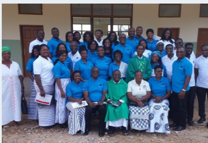
The group of Sts Peter and Paul' Parish, New Aplaku, Accra