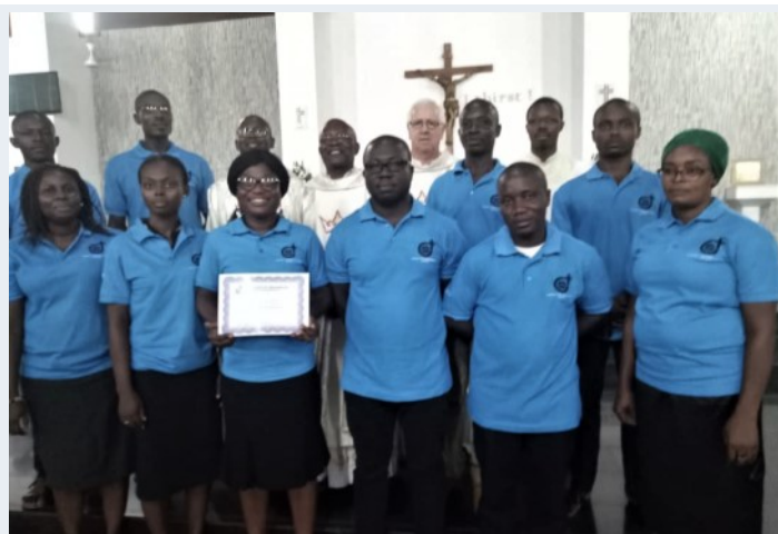
The group of Christ the King's Parish, Accra